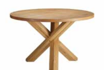
CODE - FARST H780 x W1200 x D1200